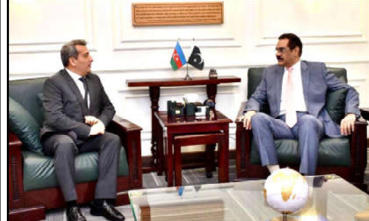
RAWALPINDI: H.E. Mr. Khazar Fahadov, Ambassador of Azerbaijan, calls on Federal Minister for Defence Production, Muhammad Raza Hayat Harraj in Rawalpindi.

The meeting was also attended by Deputy Prime Minister and Foreign Minister Senator Mohammad Ishaq Dar, Chief of the Army Staff Field Marshal Syed Asim Munir, and senior cabinet members.