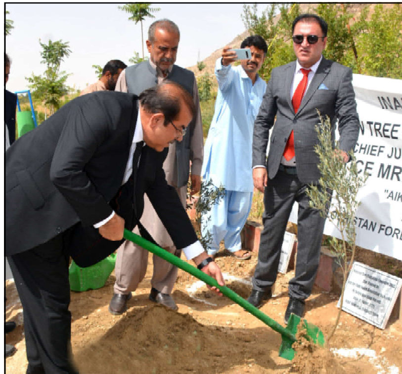
QUETTA: Chief Justice of the Balochistan High Court, Justice Rozi Khan Bareech inaugurating the 2025 Monsoon Tree Plantation Campaign by planting a sapling at Koh Meherdar.

"The dream of a clean and green Balochistan can only be achieved through joint efforts," he said, urging citizens to partner with the government in making the plantation drive a success.