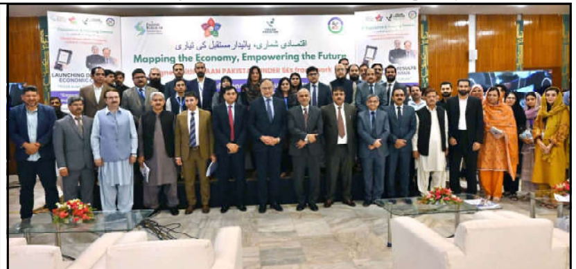
ISLAMABAD: Federal Minister for Planning, Development & Special Initiatives Prof. Ahsan Iqbal in a group photograph during launching ceremony of Economic Census Results.