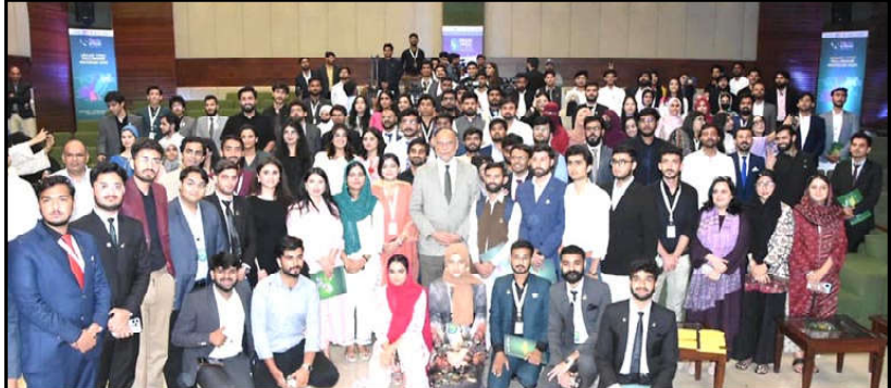
ISLAMABAD: Federal Minister for Planning, Development & Special Initiatives, Ahsan Iqbal, with participants at the closing ceremony of the URAAN Summer Scholars Program and the YPDC Fellowship, attended by youth from across Pakistan and overseas.

Senator Mohammad Ishaq Dar, Deputy Prime Minister and Foreign Minister; Ahsan Iqbal, Minister for Planning, Development & Special Initiatives; Syed Mohsin Raza Naqvi, Minister for Interior and Narcotics Control; Bilawal Bhutto Zardari, Chairman PPP; Hina Rabbani Khar, MNA; Spokesperson to President, Murtaza Solangi; Secretary Foreign Affairs and Ambassador of Pakistan to China were also present during the meeting.