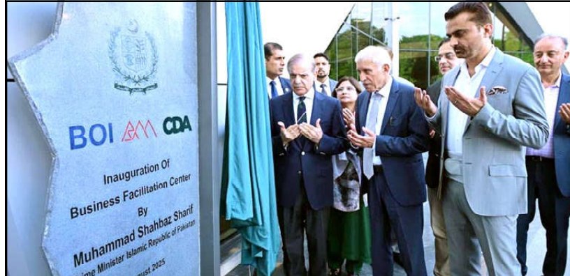
ISLAMABAD: Prime Minister Muhammad Shehbaz Sharif inaugurates the Business Facilitation Centre.

Prime Minister Shehbaz called for making the facilitation center attractive and popular in other countries and establishing it as a model, paving the way for its replication in other parts of the country. In his remarks, BOI Minister Qaiser Ahmed Sheikh called the establishment of the center a breakthrough in investment facilitation. He said that earlier, the investors had to visit various departments to accomplish the required procedures for setting up their businesses; however, the BFC will reduce this hassle, besides remarkably reducing the timelines.