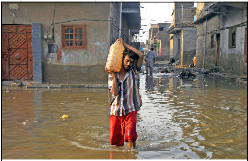
KARACHI: Children remove rainwater from their homes after torrential rains at Rahim goth in as Since the start of the monsoon season on 26 June, the death toll from rains and flooding in Pakistan has reached at least 748.