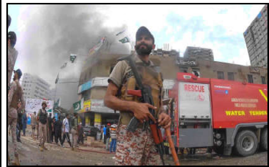
KARACHI: A view of smoke rise in a firecracker warehouse on MA Jinnah road after a powerful explosion, at least 33 people were injured. A massive fire that engulfed nearby buildings and vehicles.

The minister stressed that knowledge alone is not enough, but its true test lies in its application.