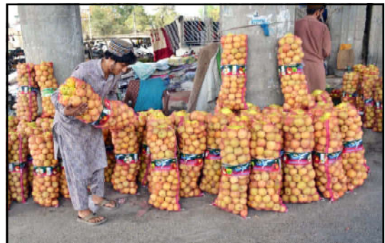
QUETTA: A fruit trader arranges apple bags to attract customers at Joint Road, Quetta.

M-Grass is the only publicly listed grass seed company in China and ranks fourth globally for innovation in the sector.