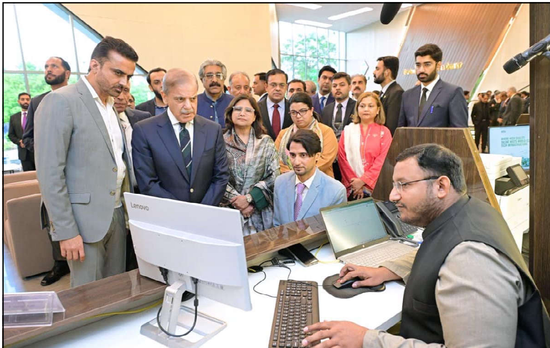
ISLAMABAD: Prime Minister Muhammad Shehbaz Sharif is being briefed on different desks of Board of Investment's 1st Business Facilitation Center.