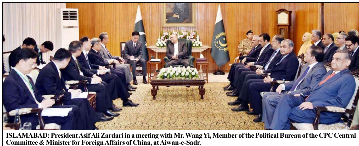
ISLAMABAD: President Asif Ali Zardari in a meeting with Mr. Wang Yi, Member of the Political Bureau of the CPC Central Committee & Minister for Foreign Affairs of China, at Aiwan-e-Sadr.