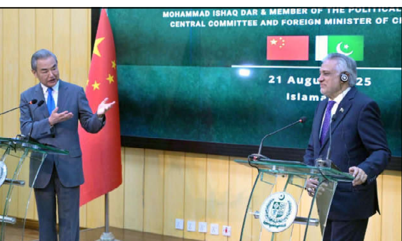
ISLAMABAD: Deputy Prime Minister/Foreign Minister Senator Mohammad Ishaq Dar and Chinese Foreign Minister Wang Yi addressing a joint press stakeout at Ministry of Foreign Affairs.

ISLAMABAD (APP): Pakistan and China on Thursday reaffirmed their unwavering commitment to the high-quality development of the upgraded China-Pakistan Economic Corridor (CPEC) during the 6th Strategic Dialogue held here between Deputy Prime Minister and Foreign Minister Mohammad Ishaq Dar and Chinese Foreign Minister Wang Yi.