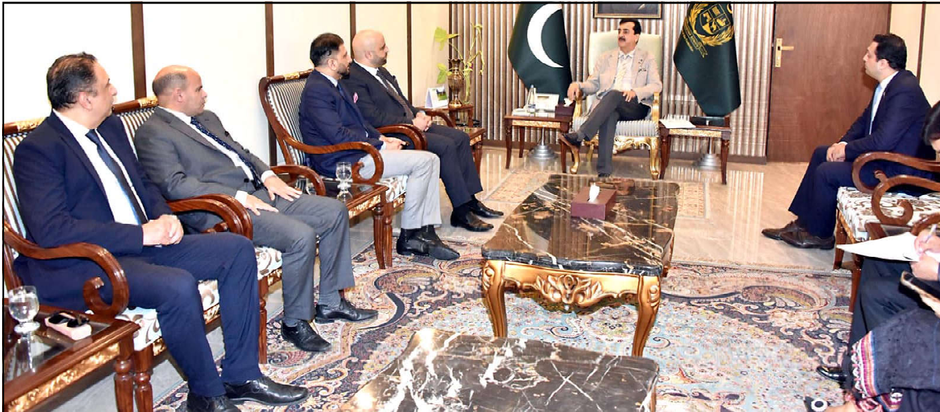
ISLAMABAD: A delegation from the Libyan Sovereign Fund calling on Chairman Senate, Syed Yousaf Raza Gilani at Parliament House in the federal capital.