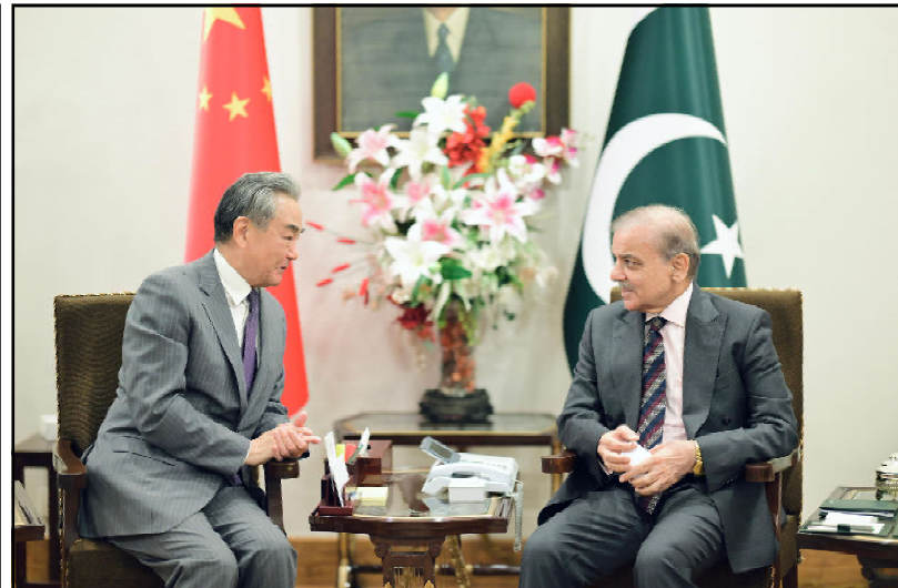
ISLAMABAD: Prime Minister of Pakistan meets Foreign Minister of China Minister for Foreign Affairs of the People's Republic of China, Mr. Wang Yi, who is on an official visit to Pakistan, called on Prime Minister Muhammad Shehbaz Sharif at the Prime Minister House, in Federal Capital.

The prime minister also spoke with Jamaat-e-Islami Amir Hafiz Naeem ur Rehman and Federal Minister for Education and Professional Training Dr. Khalid Maqbool Siddiqui.