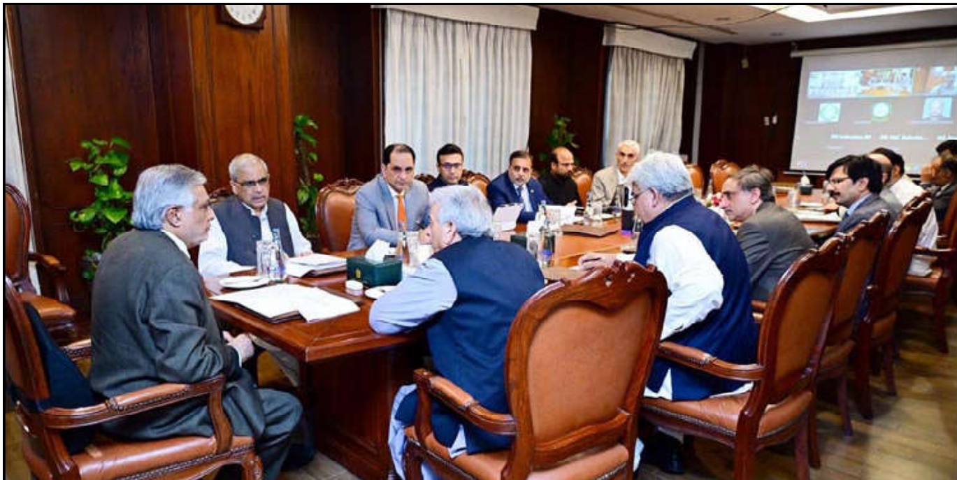
ISLAMABAD: Deputy Prime Minister and Foreign Minister, Senator Mohammad Ishaq Dar, chaired a meeting to review the availability and prices of essential commodities in the country.