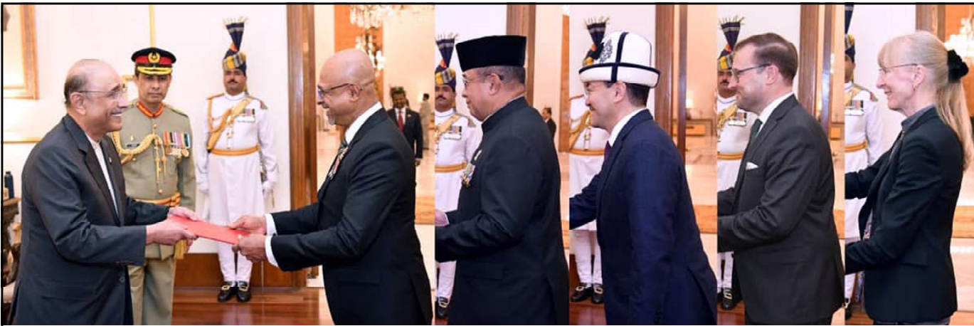
ISLAMABAD: President Asif Ali Zardari receiving credentials from the envoys of Sri Lanka, Indonesia (Chairman ASEAN Countries), Kyrgyzstan, Austria, and Germany at Aiwan-e-Sadr.