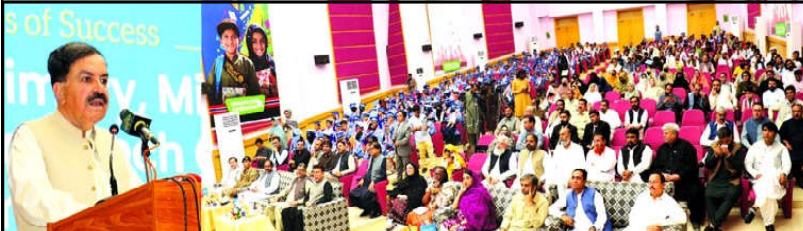
QUETTA: Balochistan Governor Jaffar Khan Mandokhel addressing the participants of prestigious educational program organized by UNICEF and the Norwegian Government on Primary, Middle and Technical Education in Balochistan at BUTEMS.

The ceremony concluded with Governor Mandokhail distributing certificates and gifts among students.