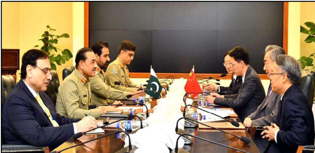
ISLAMABAD: Foreign Minister of China Wang Yi in a meeting with Chief of Army Staff Field Marshal Syed Asim Munir.