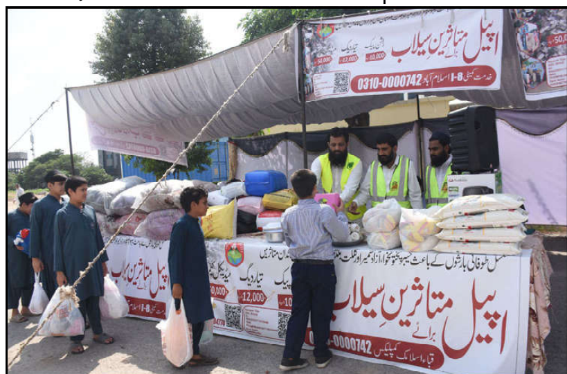
ISLAMABAD: Children are donating grocery and different others things at the Aid collection camp for the affected of Buner flood, in Federal Capital.

RAWALPINDI (APP): The Anti-Narcotics Force (ANF), conducting 3 operations across the country, recovered as many as 12 kilograms of drugs worth more than Rs 1.2 million and arrested 3 suspects, said an ANF Headquarters spokesman on Friday. He informed that 10 kg of hashish was recovered from 2 accused near Sohrah Goth Bus Terminal, Karachi.