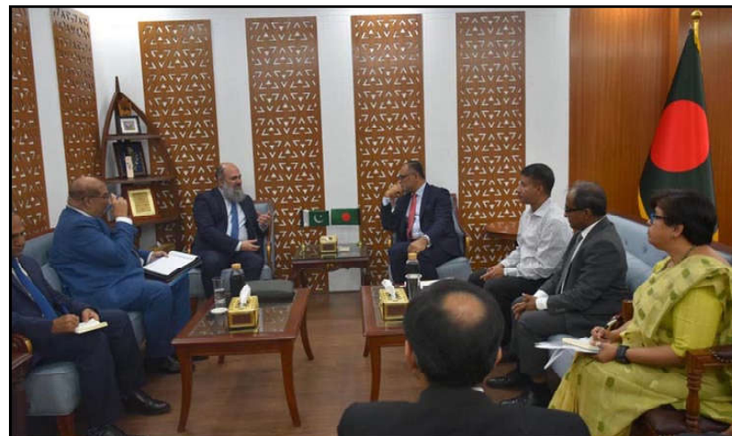
DHAKA: Federal Minister for Commerce Jam Kamal Khan meets Bangladesh's Adviser for Commerce Sk. Bashir Uddin to discuss promotion of bilateral trade and investment.

Ambassador Zaidong also presented a cheque to Prime Minister Sharif on behalf of the Chinese government as assistance for Pakistan's flood affectees, a gesture warmly appreciated by the Prime Minister.