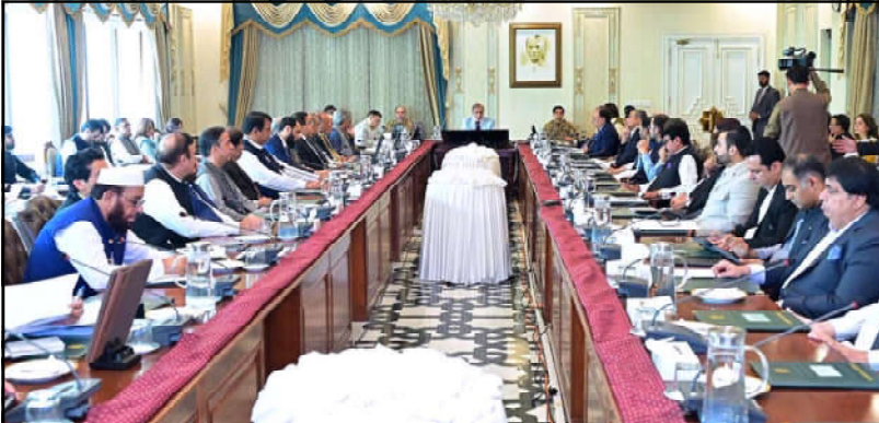
ISLAMABAD: Prime Minister Muhammad Shehbaz Sharif Chairs Federal Cabinet Meeting.

The meeting also approved the presentation of the Annual Report of the National Economic Council for fiscal year 2023-24 before Parliament, and endorsed decisions taken by the Economic Coordination Committee (ECC) on August 19 and the Cabinet Committee on Legislative Cases (CCLC) on August 18.