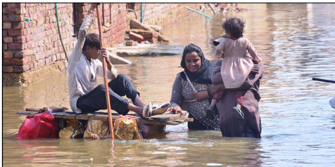
HYDERABAD: Rain-affected residents of Fatima Jinnah Colony use a makeshift boat made of wood and air-filled bags to pass through flooded streets after torrential rain in the city last night.

The Rotary International has played a vital role in this battle against polio, contributing approximately $ 500 million to enhance the national polio programme, establishing vital infrastructure, and organising health camps for underserved communities. Looking ahead, Chief Minister Shah announced three major oral polio vaccine (OPV) campaigns scheduled for September, October, and December 2025, alongside a campaign targeting children up to age 15. The Sindh government remains committed to eradicating polio, aiming to ensure the highest quality of campaigns and engaging rotary clubs across districts to raise community awareness and acceptance of the vaccine.