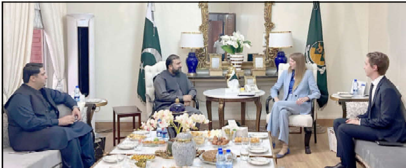
QUETTA: British High Commissioner to Pakistan Jane Marriott meeting with Balochistan Chief Minister Mir Sarfaraz Bugti.

transgender persons, minorities, and other marginalized groups, are being provided access to quality education. Additionally, in collaboration with Akhuwat Foundation, the government is introducing an interest-free loan scheme to economically empower the youth. Bugti revealed that 16,000 contractual teachers have been recruited purely on merit and comprehensive reforms in education and health departments are underway to enhance public access to essential services. For the first time in Balochistan's history, a provincial youth policy has been launched along with the CM Youth