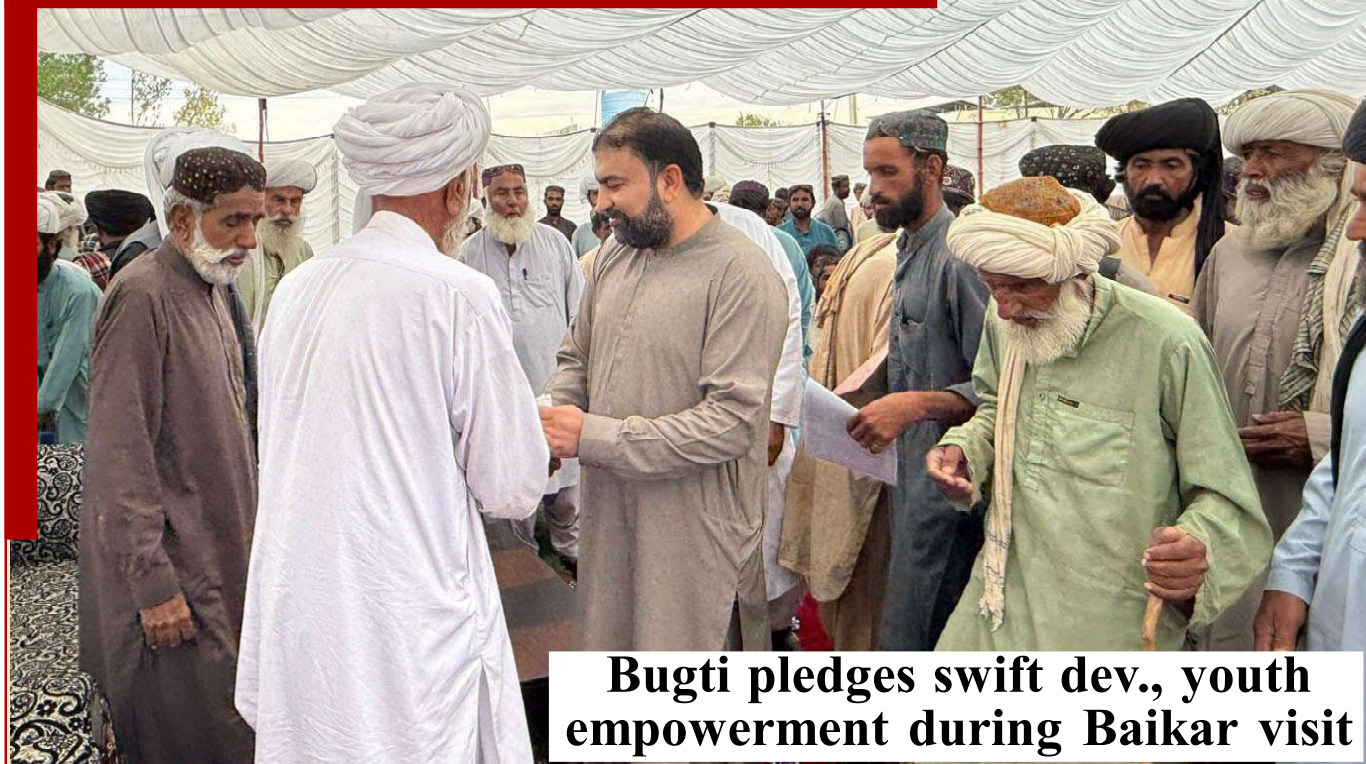
Bugti pledges swift dev., youth empowerment during Baikar visit

BAIKAR (6 AM Report): Chief Minister of Balochistan, Mir Sarfraz Bugti, has reaffirmed his commitment to public welfare and regional development, declaring the resolution of public grievances and the prosperity of his constituency among his