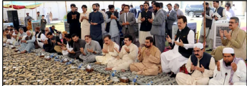
QUETTA: Balochistan Governor Jaffar Khan Mandokhel, Provincial Ministers and Senators offering Fateha on the sad demise of father of MPA Muhammad Sadiq Sanjrani.

Security was tight during the events, while national flags, banners, and bunting adorned various parts of the cities.