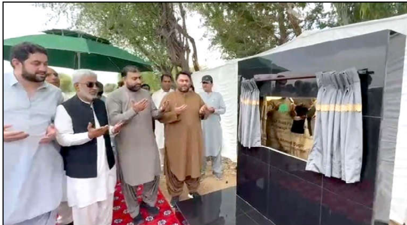
PHELAWAG: Balochistan Chief Minister Mir Sarfraz Bugti, Provincial Ministers, MPAs and tribal elites offering Dua after inaugurating Sark Dam.

The successful completion of the Sark Dam stands as a testament to the government's resolve to reduce water insecurity, expand agricultural potential, and spur socioeconomic uplift in underserved areas of Balochistan.