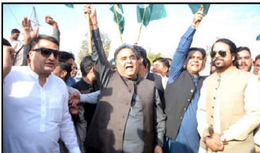
QUETTA: Senator Danesh Kumar and Parliamentary Secretary for Minority Affairs Sanjay Kumar chant slogans during Defence Day rally.

"The dream of an educated Balochistan cannot be achieved without the unwavering backing of international organizations," he stressed.