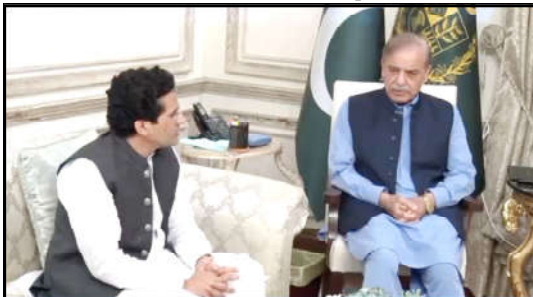
LAHORE: Minister for Petroleum Ali Pervaiz Malik called on Prime Minister Shehbaz Sharif.

According to NDMA, the rains are being driven by a weather system currently positioned over the Gujarat-Rajasthan border, which is moving westward and expected to bring intermittent rainfall across Sindh, southern Punjab, and parts of Balochistan until September 10.