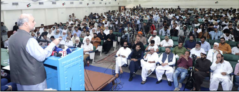
LAHORE: Jamaat-e-Islami Emir Hafiz Naem ur Rehman addressing the condolence reference held in memory of Late Professor Khurshid Ahmed at Mansoorah.

FAISALABAD/CHINIOT (APP): Federal Minister for Investment Board Qaiser Ahmed Sheikh said that the government and public representatives stand united on one platform to ensure complete rehabilitation of flood victims and despite difficulties, the flood-affected people would not be left alone. Talking to the media at Adda Pathankot in Chiniot, he said a comprehensive plan is being implemented for reconstruction and rehabilitation of affected areas so that relief can be provided to flood-hit families without delay. He said that the government has released a special grant of Rs.250 million which is being utilized on priority basis in flood-hit areas while more funds are also under consideration to complete rehabilitation process. The minister appreciated the contribution of philanthropists and local organizations.