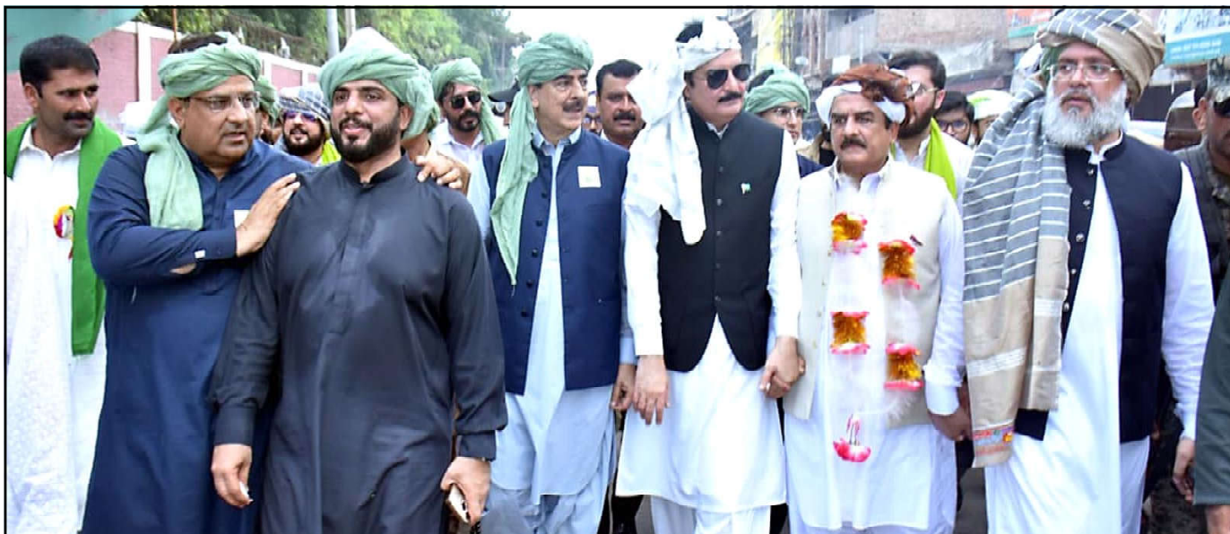
MULTAN: Chairman Senate Syed Yusuf Raza Gilani and Governor KPK Faisal Karim Kundi leading the 100th annual procession of Eid Milad-un-Nabi organized by Anjuman Islamia on 12th Rabi-ul-Awwal.