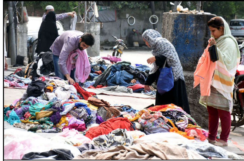
LAHORE: Women are busy in buying secondhand cloths at a Landa Bazaar in Provincial Capital.

Saif Ur Rehman added that coordinated efforts, supported by foreign investment and technology transfer, would enable Pakistan to emerge as a strong player in the global blue economy, ultimately ensuring sustainable prosperity. He stressed that strengthening regulatory frameworks, improving governance, and fostering collaboration between provincial and federal institutions were key to enhancing the effectiveness of blue economy initiatives. Highlighting Pakistan's natural advantage, he noted that the country is blessed with a 1,000 kilometer long coastline and a strategic location along major international sea routes. However, he regretted that these maritime resources remain underutilized due to lack of awareness, policy gaps, and inadequate infrastructure.