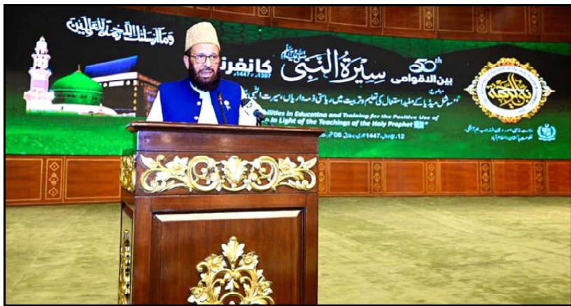
ISLAMABAD: Federal Minister for Religious Affairs and Inter faith Harmony, Sardar Muhammad Yousaf addressing the 50th International Seerat-un-Nabi (PBUH) Conference.

The commemorative event, held at Government High School Jinnah Town in Quetta, featured patriotic speeches, national songs, and student-led tableaux. Minister Raheela Durrani underscored the historical significance of September 6, 1965, calling it a defining moment in Pakistan's military history. "On this day, our armed forces stood as an unbreakable iron wall against India," she said, adding that their valor "shattered the arrogance of the enemy."