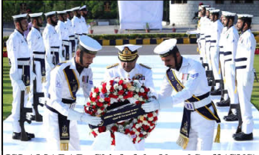
ISLAMABAD: Chief of the Naval Staff (CNS) Admiral Naveed Ashraf laid floral wreath at Shuhada Monument on Defence Day.

"Let us together today reaffirm our resolve that as a nation, we will illuminate the darkness of illiteracy with the light of knowledge and lay the foundation for a strong, talented, and developed Pakistan," he concluded.