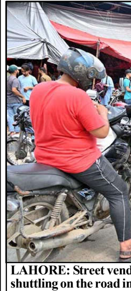
LAHORE: Street vendors displaying bags to attract the customers while shuttling on the road in Provincial Capital.

She also visited all stalls installed by many foreign companies. She also reviewed in detail the models put on display in relations with modern mass transit projects. NORINCO International has already been operating a modern transport system in Pakistan in the wake of launch, operation and maintenance Orange Line Metro Rail Transit System (OLMT) in Lahore, the first electric railway transportation project completed on October 25, 2020 under China-Pakistan Economic Corridor (CPEC).